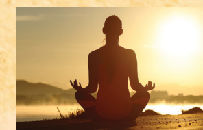
Yoga / Meditation