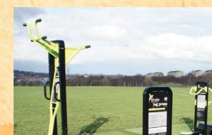
Open Gym Areas