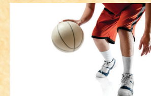
Basketball / Ball Court