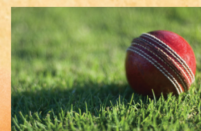
Cricket / Football Fields